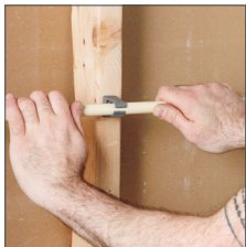
Place pipe into clamp