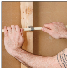
Push pipe to secure and lock