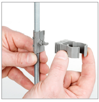
Close adapter and join clamp