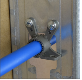
Insulates PEX pipe when mounted on metal studs.