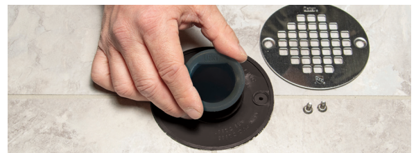
Simply press the Drain Seal firmly into place