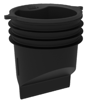
Drain Seal for Linear or Decorative Shower Drains