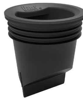
2" or 3" Diameter Drain Seal for Showers & General Purpose Drains